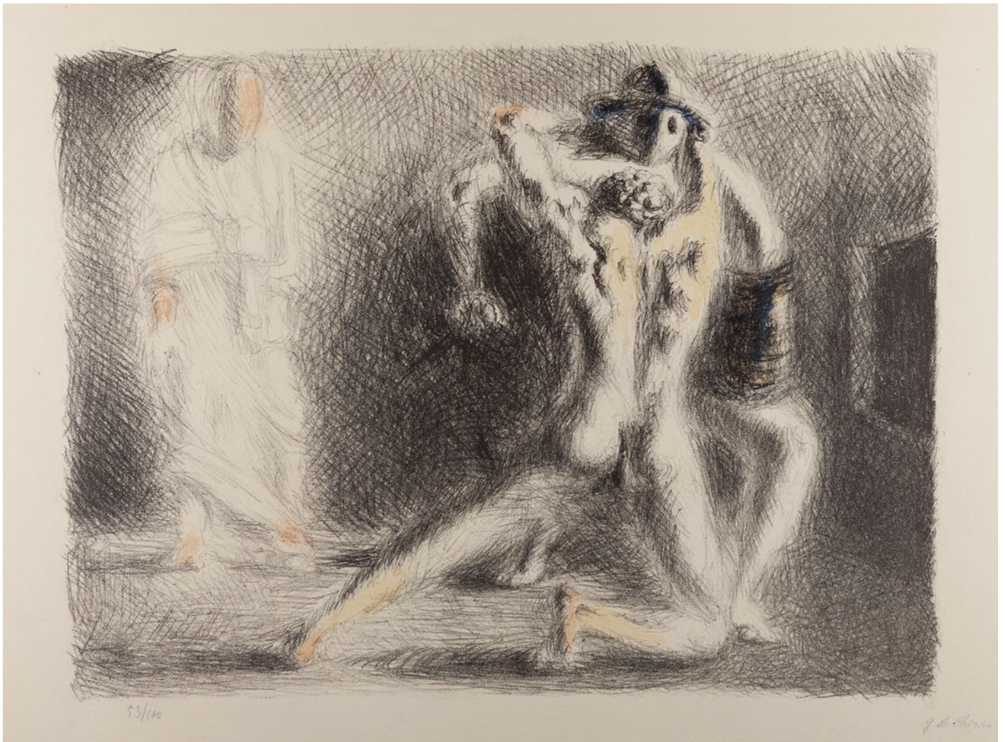
Giorgio de Chirico, Return of the Prodigal Son , early 20th Century, Color lithograph on paper, Collection MCAM, Museum Purchase, Susan L. Mills Fund.

Frank van Sloun (United States, 1879–1938) Suzanna and the Elders No.2 , 1931 Etching on paper 15 \frac{7}{8} in. x 17 \frac{15}{16} in. Gift of Thomas Andert, 1980.11.26