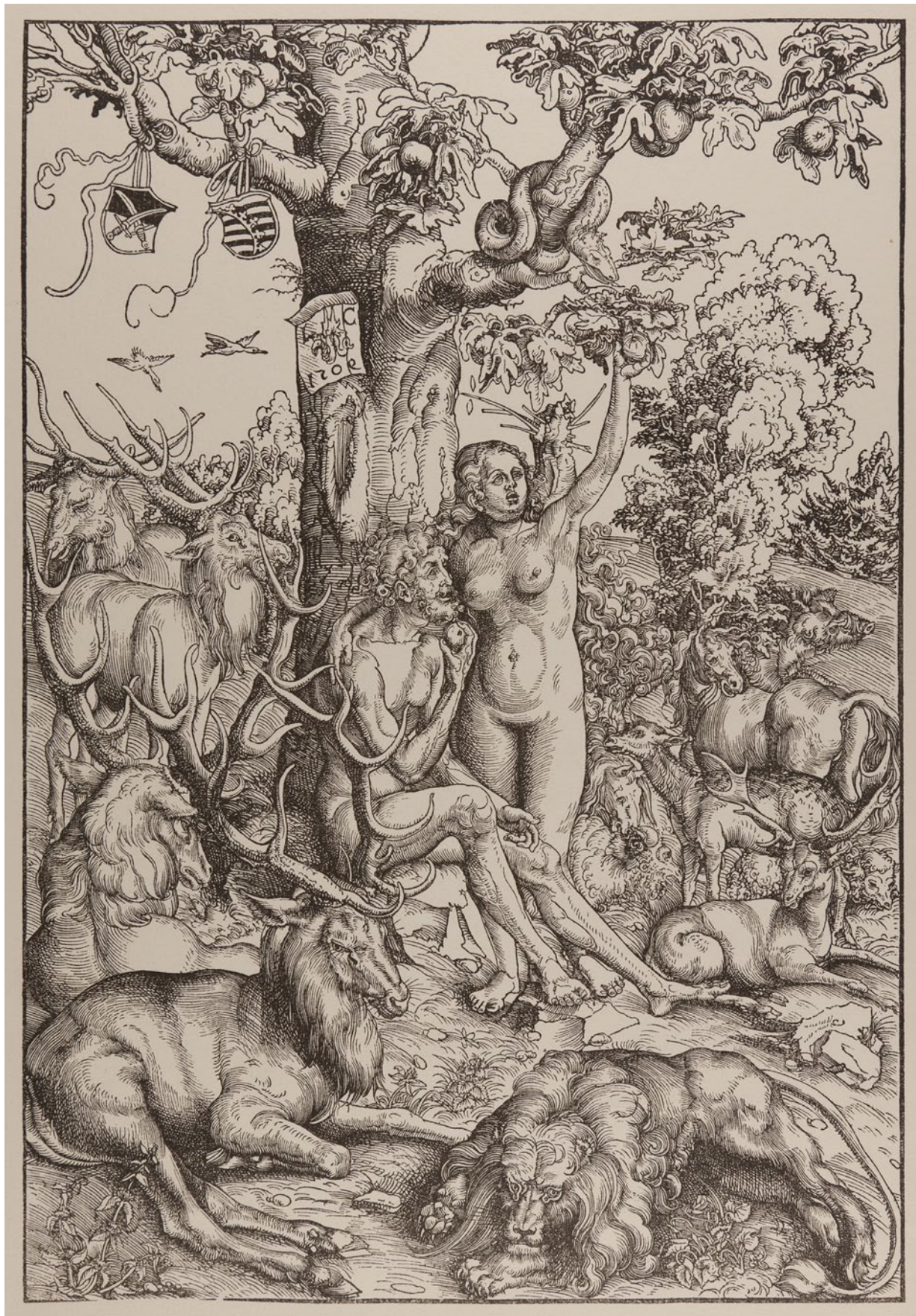
Lucas Cranach, the Elder, Adam and Eve in Paradise , 1910 print of a 1509 wood block print, Facsimile Reproduction, Collection MCAM, Museum Purchase, Susan L. Mills Fund.