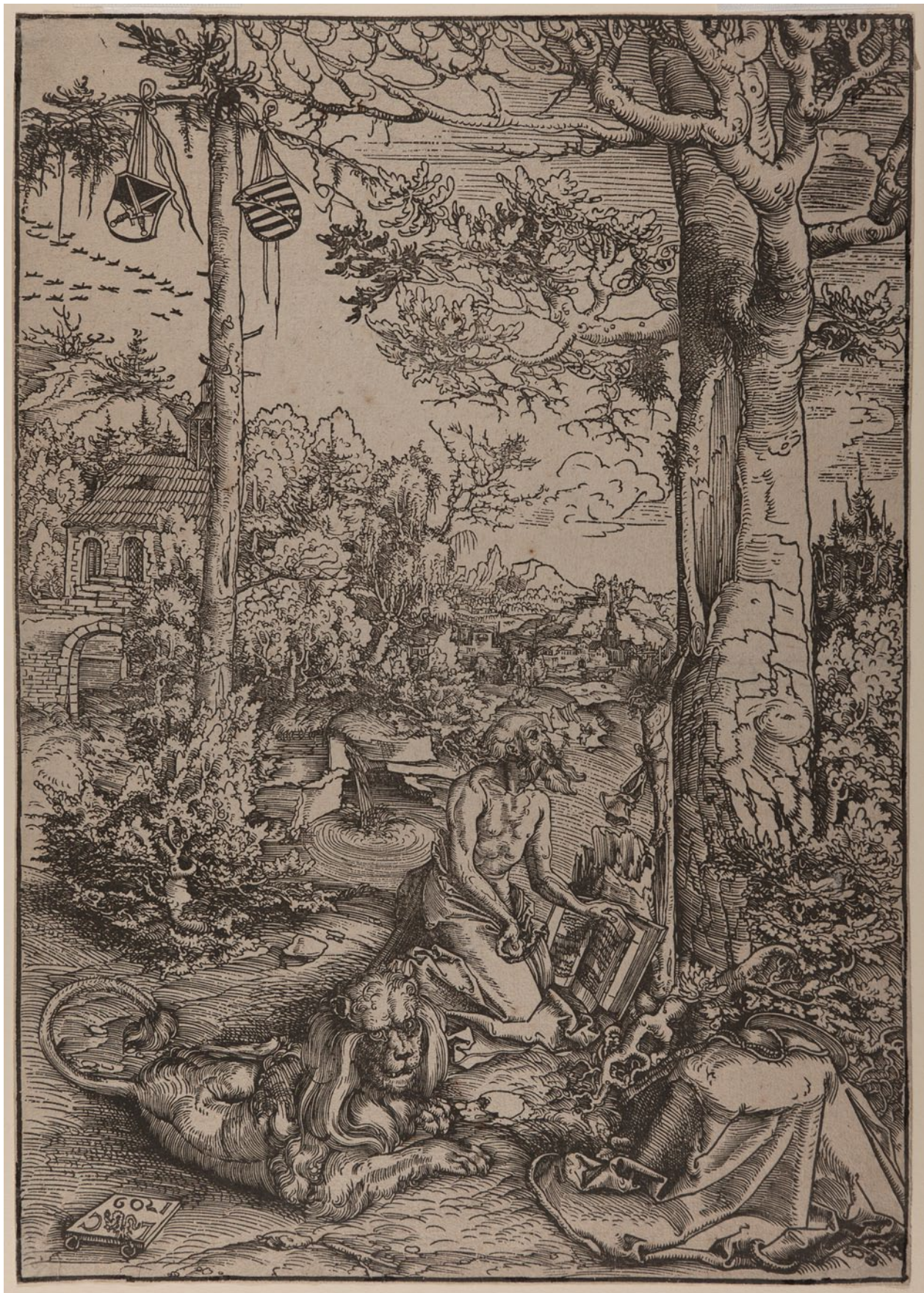
Lucas Cranach, the Elder, St. Jerome in the Desert , ca. 1506–1509, Woodcut print on paper, Collection MCAM, Museum Purchase, Susan L. Mills Fund.