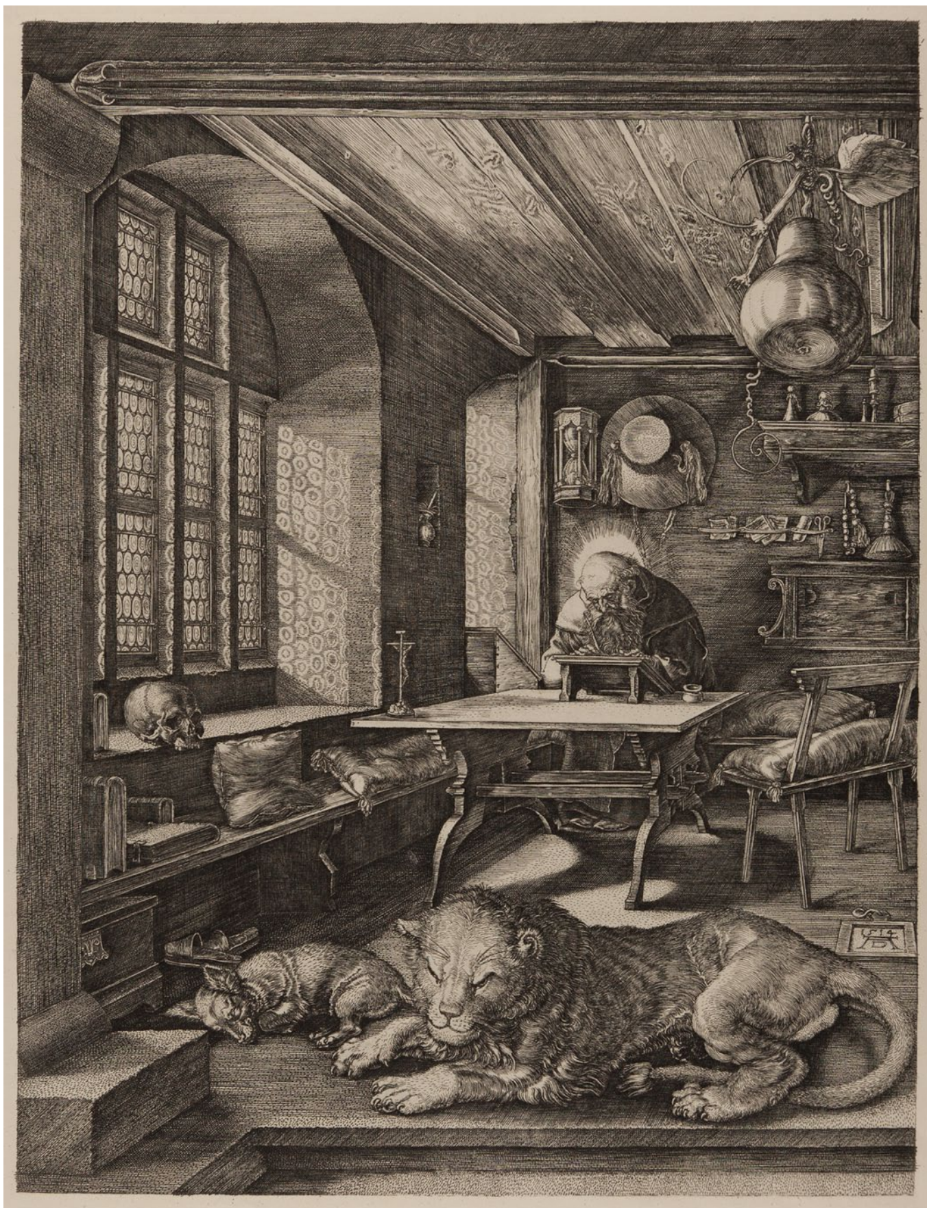
Albrecht Dürer, St. Jerome in his Study , 1910 print after 1514 engraving. Facsimile Reproduction, Collection MCAM, Museum Purchase, Susan L. Mills Fund