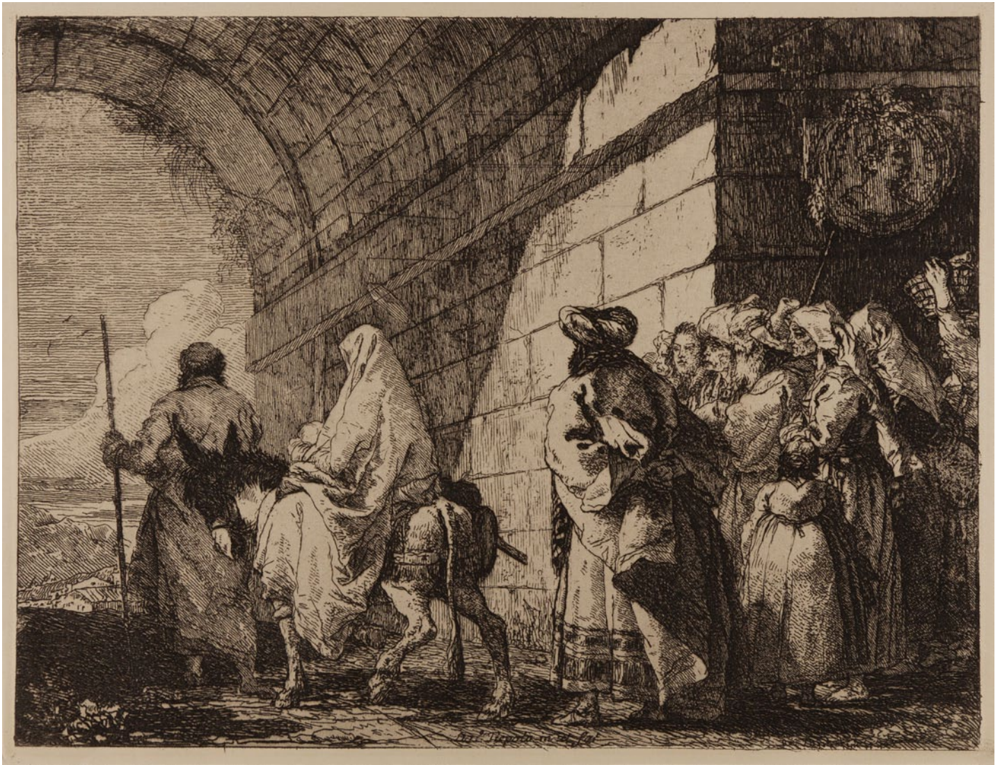
Giovanni Domenico Tiepolo, Flight into Egypt , 1910 print of 1753 etching, Facsimile Reproduction, Collection MCAM, Museum Purchase, Susan L. Mills Fund.

onlookers. Tiepolo creates an unceremonious albeit dramatic farewell. One may compare Tiepolo's humble departure to a more ostentatious rendering by Vittore Carpaccio. Carpaccio's painting on the same subject offers a more traditional and less perplexing interpretation of Matthew's story. Carpaccio's scene reveals a mountainous countryside with green hills and trees. Joseph wears a lapis lazuli garment underneath a striking red cloak that matches Mary's ornate shawl. Mary looks down at the child and gathers him to her chest in a motherly embrace. Carpaccio's painting ignores the political circumstances that color Matthew's narrative. The idyllic background and the sumptuous clothes trivialize the urgency of the angel's message to Joseph and King Herod's gruesome plot to kill the sons of Bethlehem.