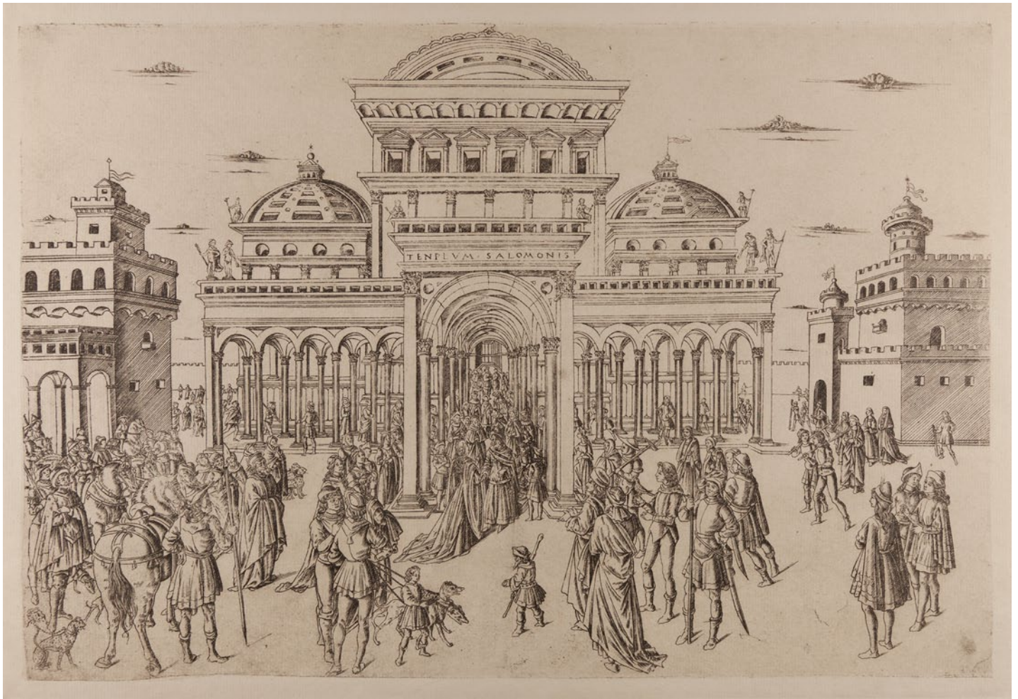
Francesco Rosselli, (Italy, 1445–before 1513), Solomon and Queen of Sheba , 1910 print of a ca. 1465–75 engraving, Facsimile Reproduction, Collection MCAM, Museum Purchase, Susan L. Mills Fund.