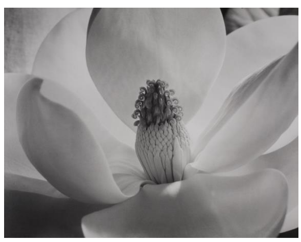
PHOTOGRAPHY & THE SPECIMEN JANUARY 11 – MARCH 23, 2025

OPENING RECEPTION: JANUARY 25, 2025 | 4:00-6:00 PM