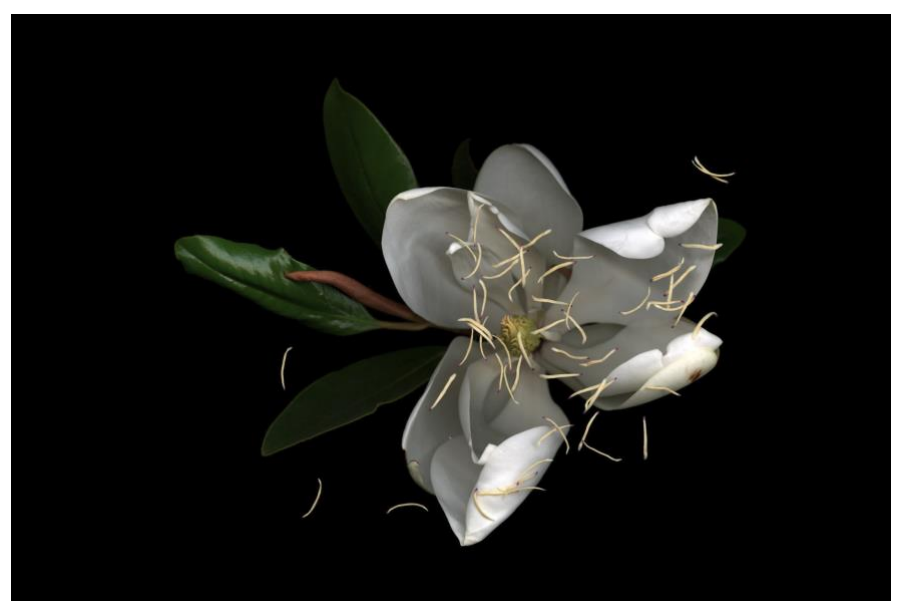
Kija Lucas, Untitled (Magnolia), 2021, Archival pigment print