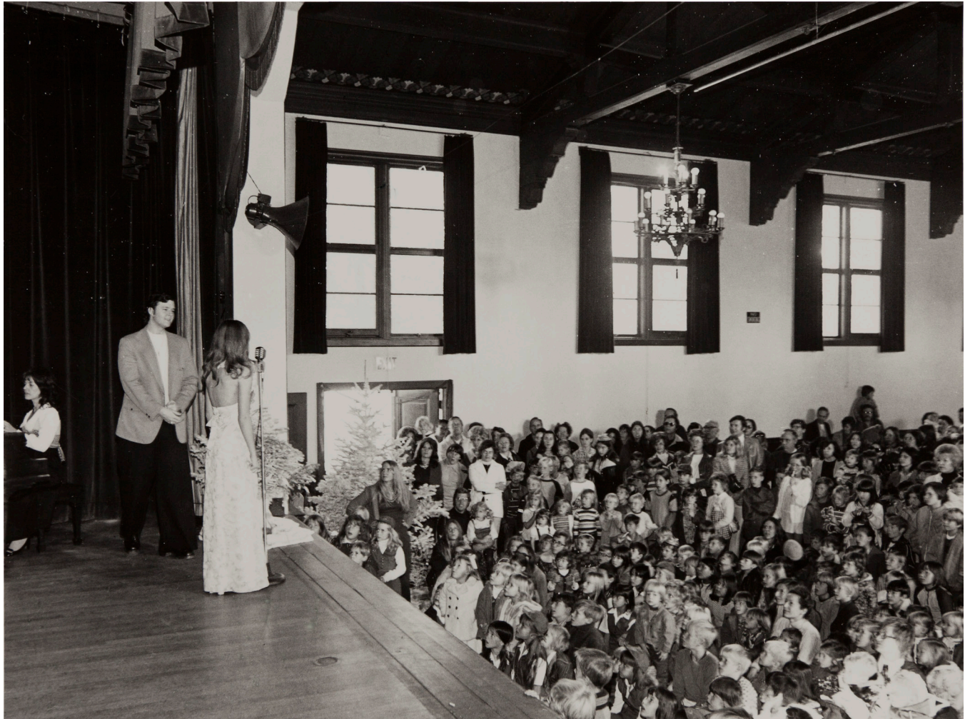
Bill Owens, Untitled [Christmas Concert]