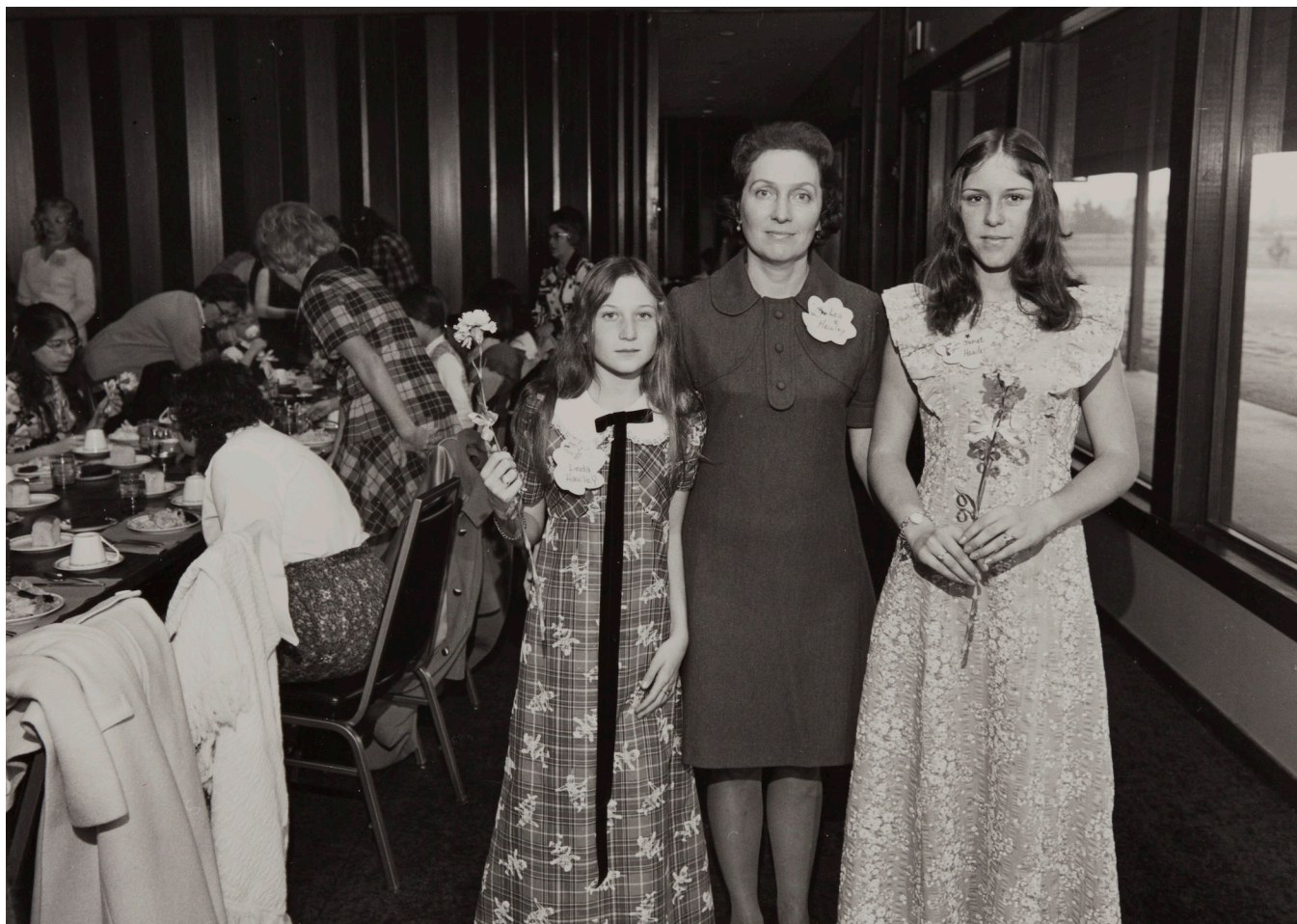
Bill Owens, Untitled [Mother/Daughter Banquet]