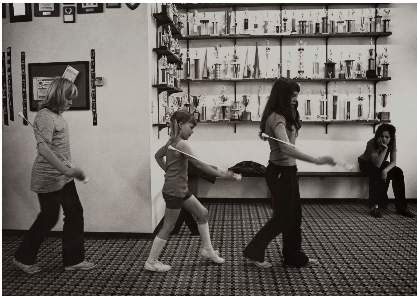
Bill Owens, Untitled [Baton Practice]