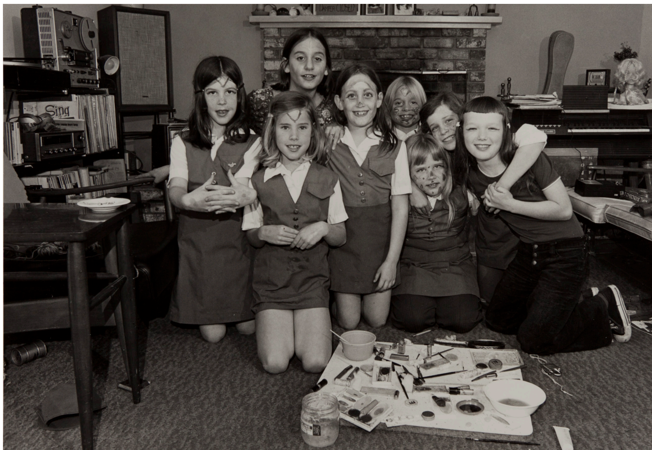
Bill Owens, Untitled [Uniformed Girls with Decorated Faces, Bluebirds]