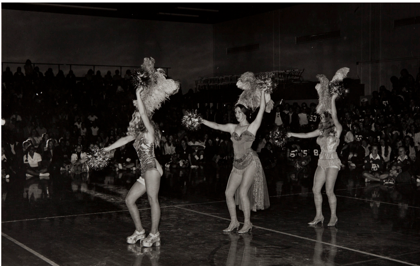
Bill Owens, Untitled [Carnival Dancers Entertain School Assembly]