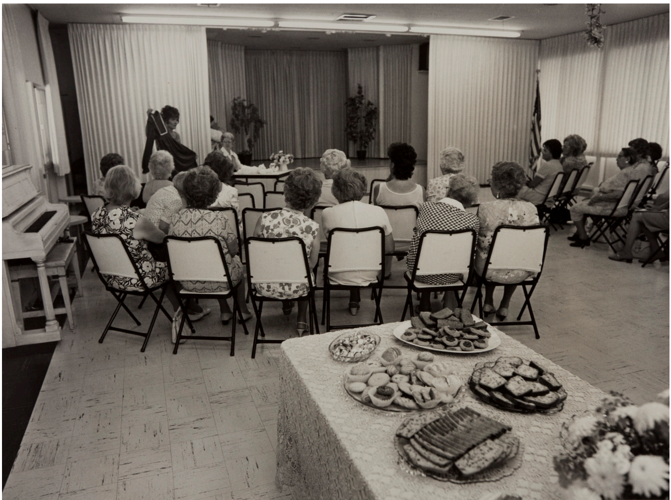
Bill Owens, Untitled [Women's Group with Gown and Cookies]