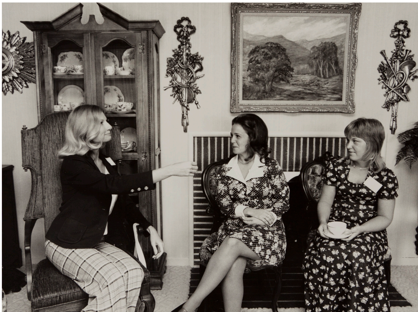
Bill Owens, Untitled [Women Seated in Living Room by Fireplace]