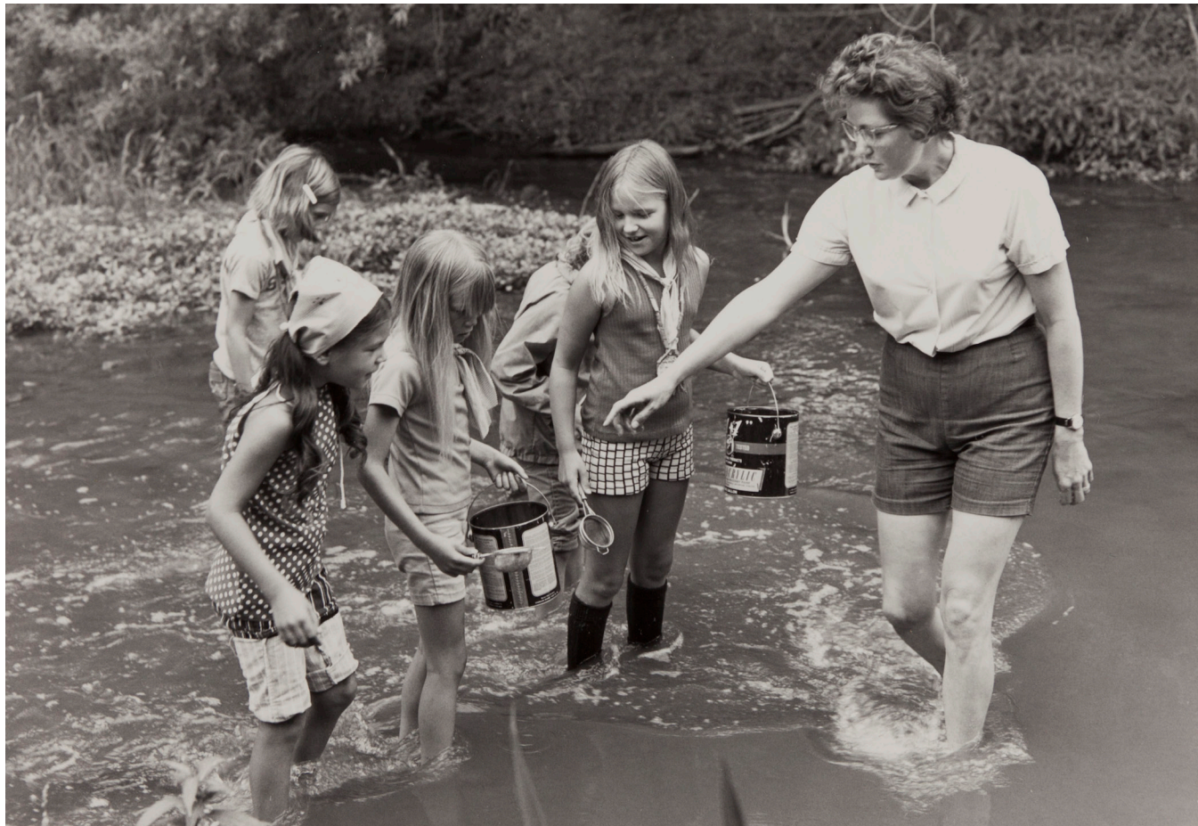
Bill Owens, Untitled [Girls Collecting Specimens in Water]