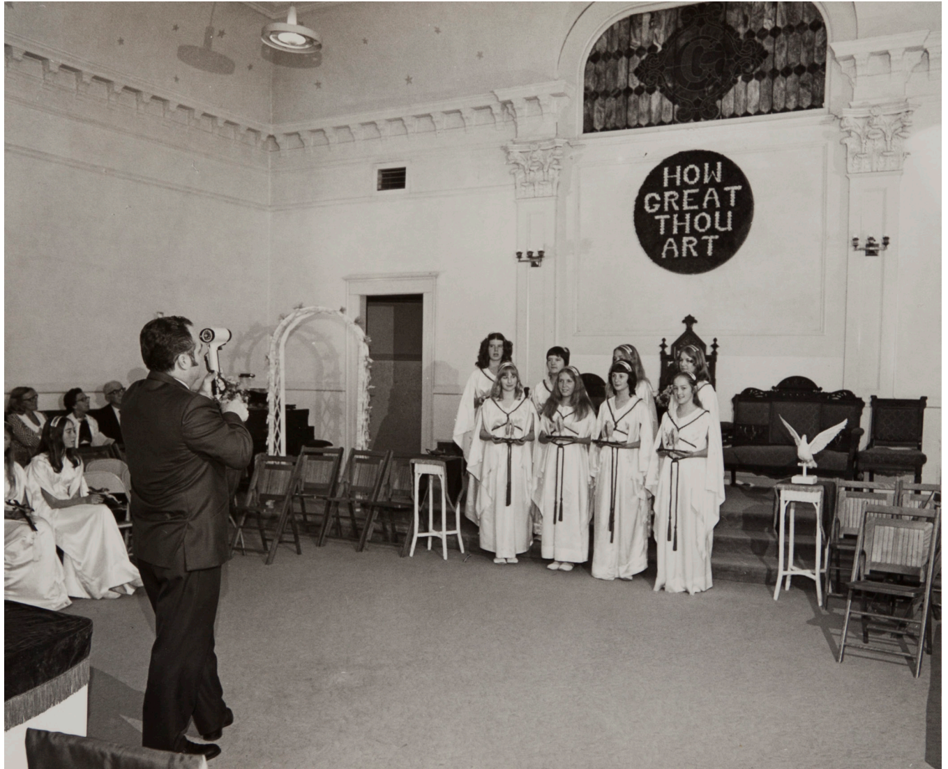
Bill Owens, Untitled [Three Crowned Women, Job's Daughters]