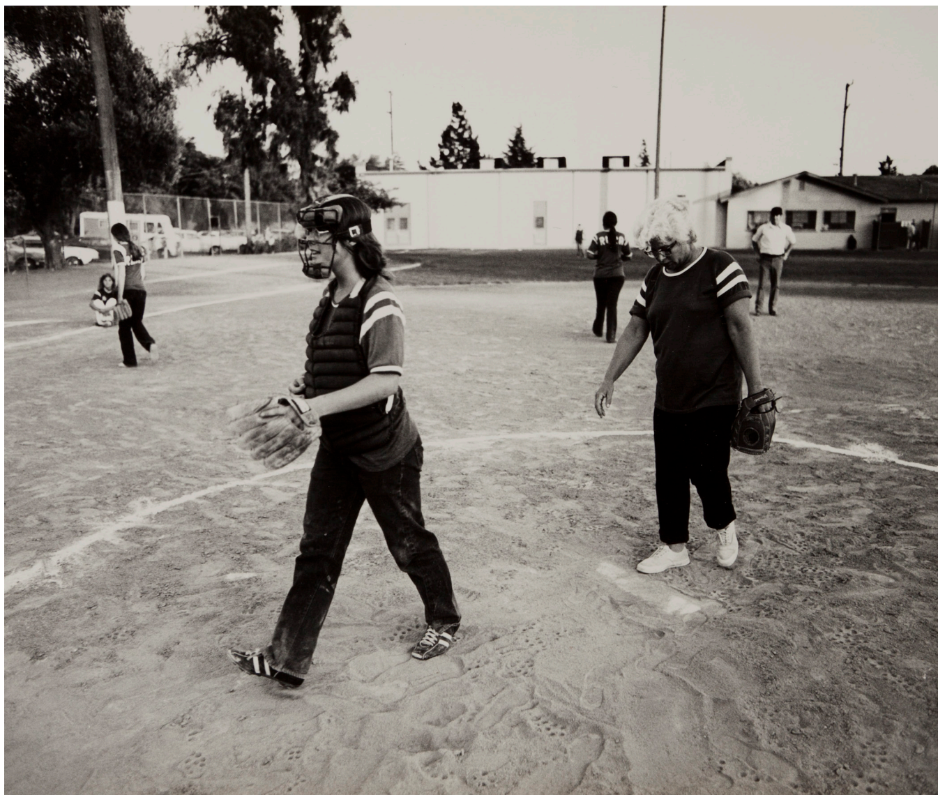
Bill Owens, Untitled [Softball Game]