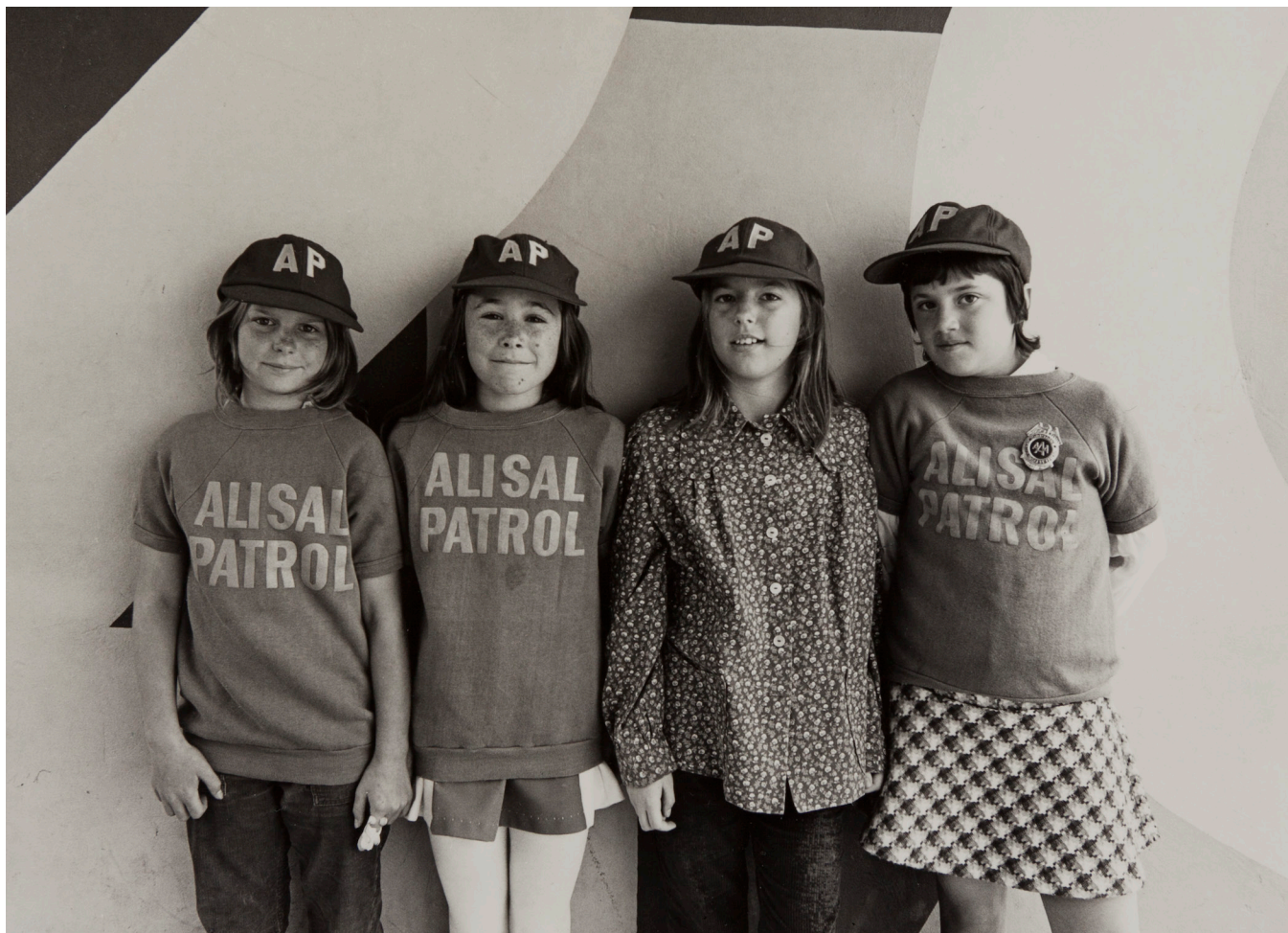
Bill Owens, Untitled [Alisal Patrol Girls]