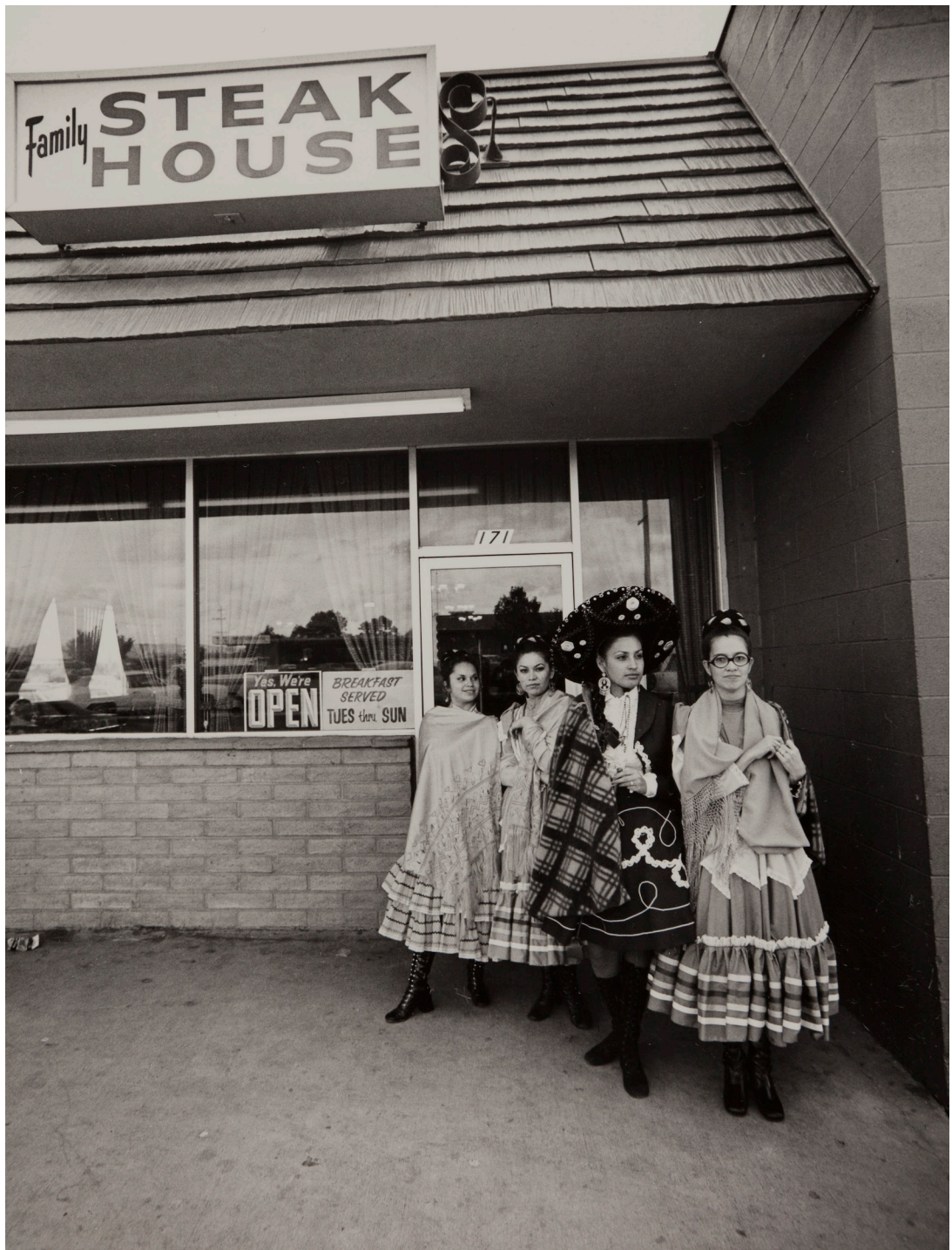
Bill Owens, Untitled [Four Women in Mexican Dress Outside Steak House]