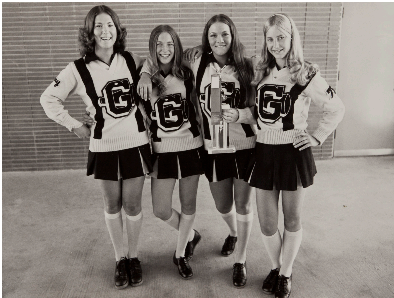
Bill Owens, Untitled [Cheerleaders]