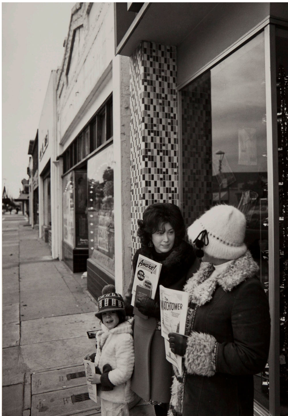
Bill Owens, Untitled [Two Women and Young Girl on Sidewalk, Jehovah's Witnesses]