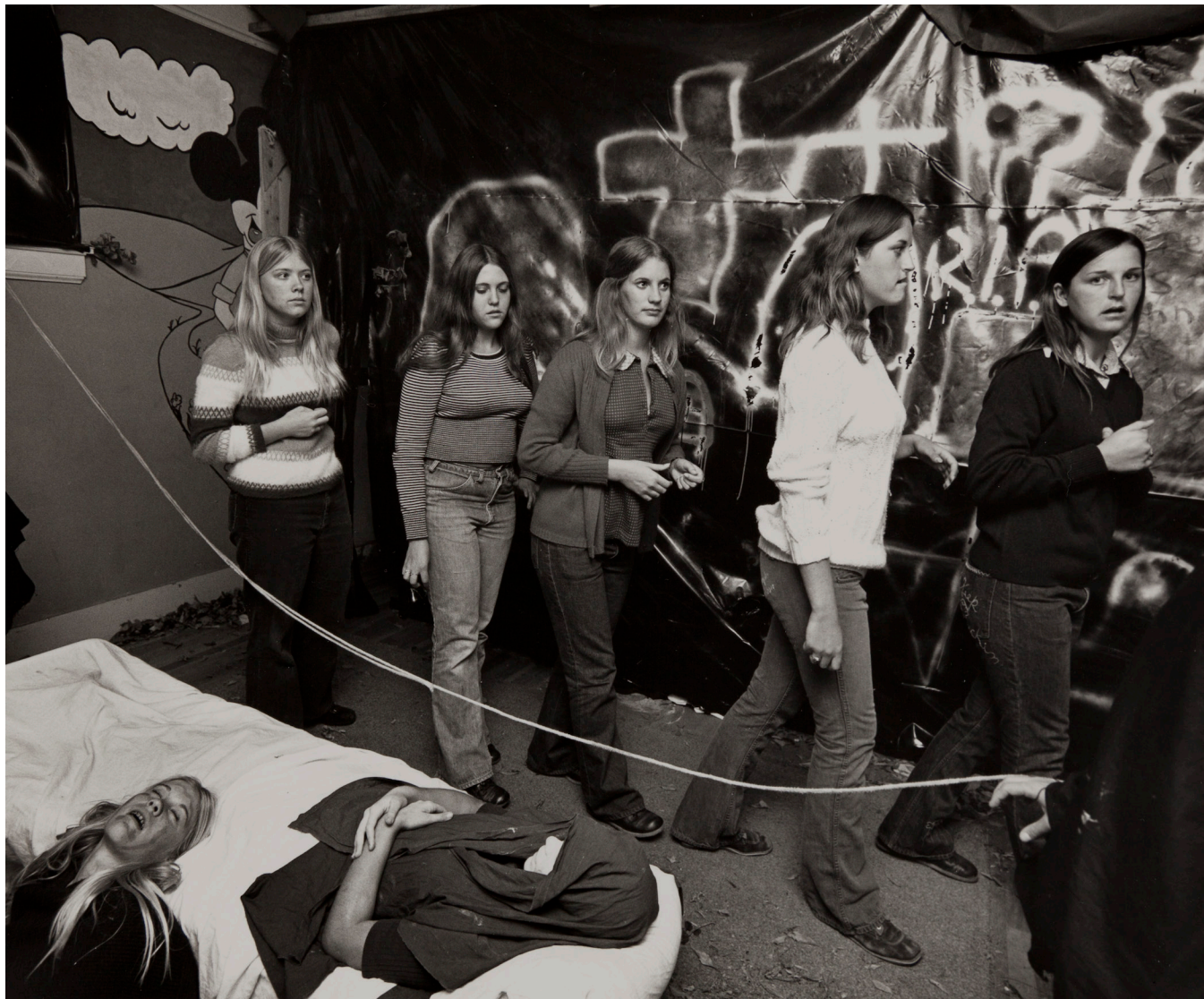
Bill Owens, Untitled [Haunted House]